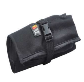
Tech Tool Bag